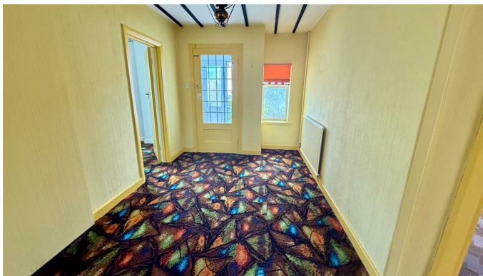
Beamed ceiling, double glazed window.